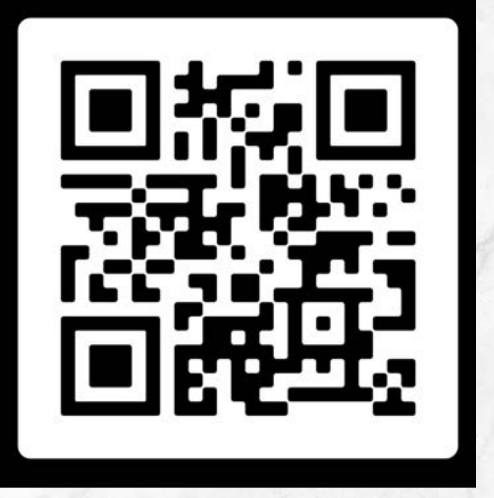
Scan Me Shop Now